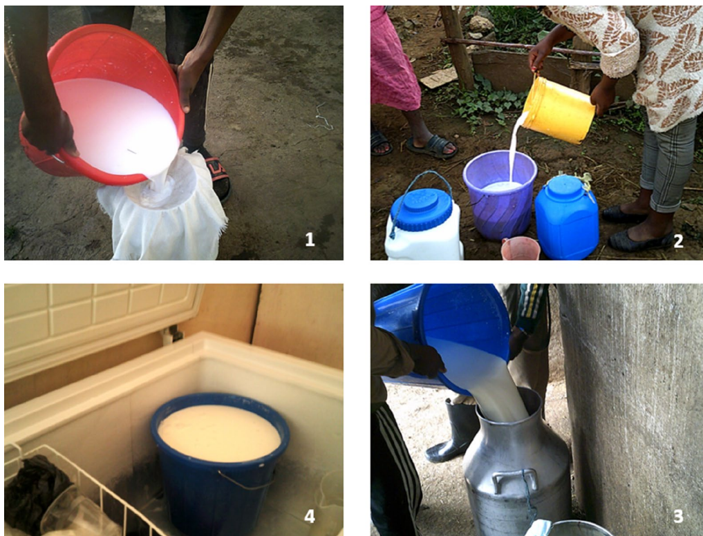
Fig. 3 Milk handling practices (Picture 1. Milk sieving, Pictures 2 and 3 milk bulking, Picture 4 milk storage)

environments did not meet the required standards to ensure hygienic milking conditions.