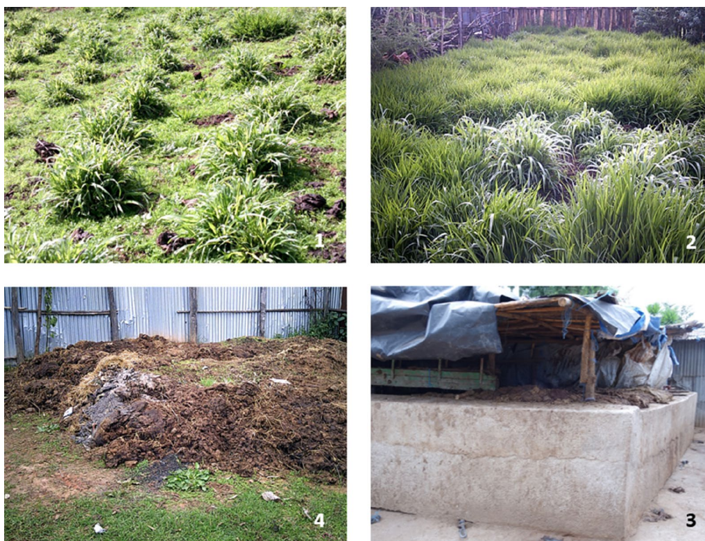
Fig. 1 Feed production and manure management (Pictures 1 and 2 Forage grasses, Pictures 3 and 4 Manure storage)