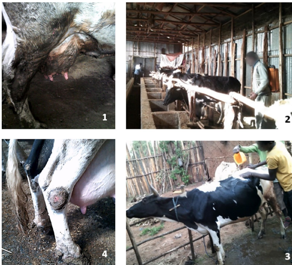
Fig. 2 Animal health and welfare practices (Picture 1. Dirty udders, Picture 2. spraying for ectoparasites, Picture 3. cleaning animals, Picture 4. leg wound, washing)

reported that mastitis was a common challenge, especially in intensive zero-grazing systems and explained it could be due to contamination of the teats with bacteria found in cow dung and the floor where the cows slept. One farmer had taken a photo of a cow that had been injured by other cattle stepping on its teats due to the housing unit being overcrowded. A farmer commented: