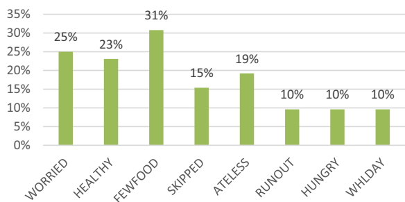
Fig. 3 Proportion of female farmers answering “Yes” to experienced food insecurity. Note: Calculated from survey results

female farmers also have to deal with the expense of simultaneously eating healthful food. It alludes to the dietary habits of women farmers, who tend to eat a lot of grains and vegetables but not as much of other healthful items like milk, meat, or fish. Apart from being financially incapacitated, the food culture factor in the Java region also influences the commodities consumed by female farmers (the staple food is rice supplemented with vegetables and a side dish of tempeh-tofu). The fifth item (ATELESS) also shows experiences considered like the third question item (FEWFOOD) by female farmers. However, female farmers experience less difference compared to eating certain types of food. The eight FIES questions conclude that the most significant percentage of female farmers who inconsistently answered the FEWFOOD items (8%) and ATELESS was 4%. However, both can still be used to measure women farmers’ food insecurity level due to their unique experience of food insecurity, as explained above.